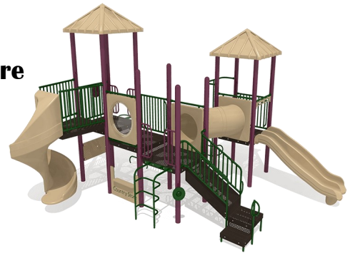
Super Sonic Spinner