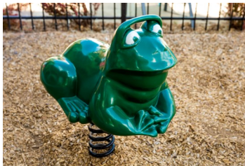
Frog Spring Rider