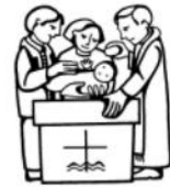
I baptize you in the name of the Father and of the Son and of the Holy Spirit—

Congratulations to the newest member of the Body of Christ / Felicidades a los nuevos miembros del Cuerpo de Cristo