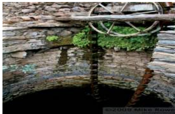
ADULT FORMATION